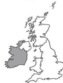
Map of the UK

Make a map of an imaginary island, use a key to show important places.